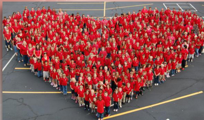
St. Matthew School