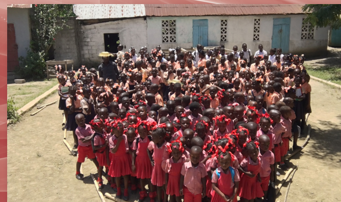
Haiti School Friendship Program