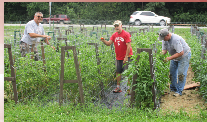
Harvest for the Hungry Garden